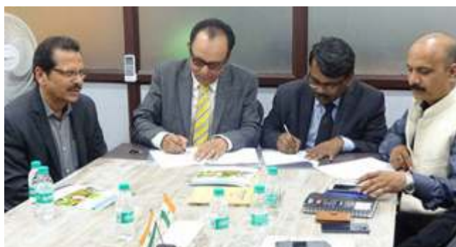
IACG SIGNED MOU WITH US BASED GLOBAL AGRI BIO LINKAGES INC