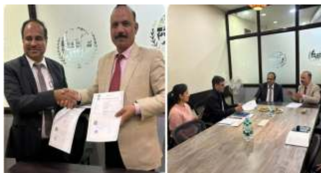
IACG SIGNS MOU WITH AFC INDIA LTD. (AFC)